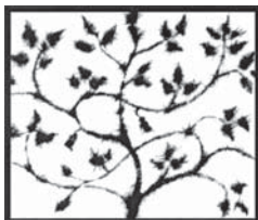
pacific school of religion

Pacific School of Religion (PSR) is committed to serving God by equipping historic and emerging faith communities for ministries of compassion and justice in a changing world. We affirm our historic mission to educate men and women for ministry and other forms of religious leadership and to be a center and resource for Christian thought in an interfaith and pluralistic context. We affirm our ecumenical and Christian heritage and commitment as an open and affirming community that honors diversity and presses toward racial, gender, sexual orientation, and economic justice. PSR's commitments find expression in innovative programs of scholarship and education for clergy and laity. Strong faith communities require an integration of faith and reason, theory and practice, piety and critical intellect, tradition and creativity. We seek to embody these values and disciplines in our programs and our common life. [To read the complete mission statement, go to www.psr.edu.]